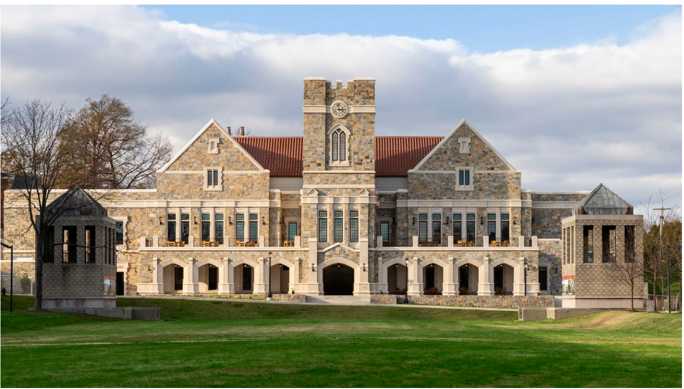
6 | APA – PREQUALIFY YOUR PRECASTER | www.archprecast.org