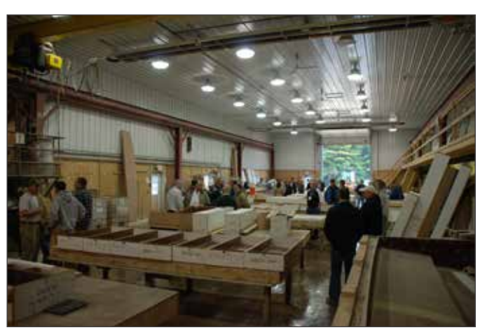
Northern Design's production floor during the 2008 Spring Workshop.

We will have a fun optional event at the Sig Sauer Academy. Whether you're a complete beginner or a seasoned shooter, this action-packed event welcomes everyone. Train alongside Sig Sauer's elite instructors—experts with decades of experience in military and law enforcement firearms tactics. They cater to all skill levels, ensuring a safe and exciting experience for every participant. You'll have the chance to learn essential techniques and test your skills with Sig's cutting-edge handguns and rifles, all at their state-of-the-art training facility.